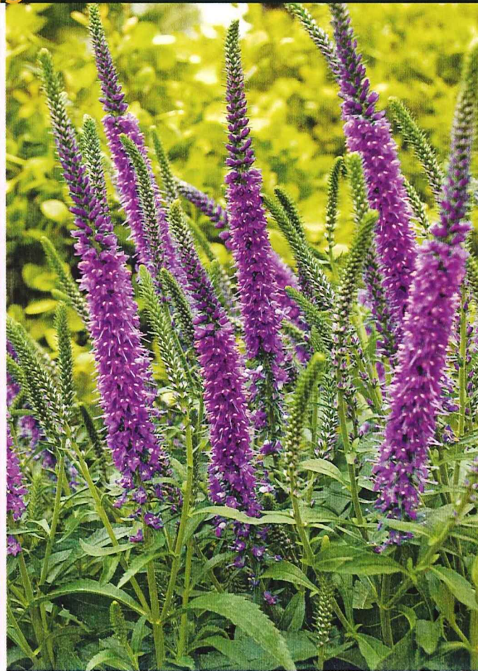
PHOTOS: Courtesy of Proven Winners (candytuft); courtesy of Walters Gardens, Inc. (veronica)