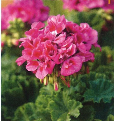
Fantasia™ Purple Sizzle geranium Pelargonium hybrid