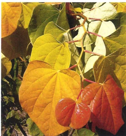
Rising Sun™ redbud Cercis canadensis 'JN2'