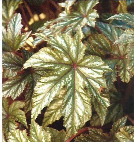
'Gryphon' begonia Begonia hybrid

SOURCE Garden Crossings LLC www.gardencrossings.com, 616-875-6355