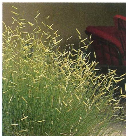
'Blonde Ambition' blue grama grass Bouteloua gracilis