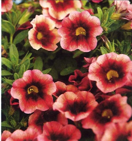
Superbells® Coralberry Punch calibrachoa Calibrachoa hybrid