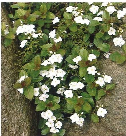
'Whitewater' veronica Veronica hybrid